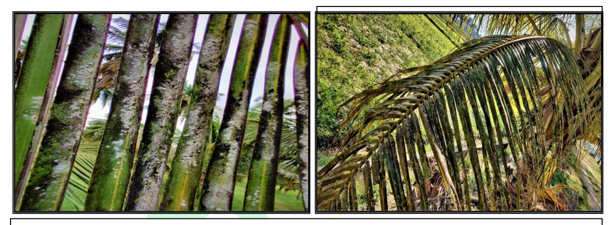
Fig. 2. Coconut leaves covered with Waxy filament secreted by nymphs of RSW